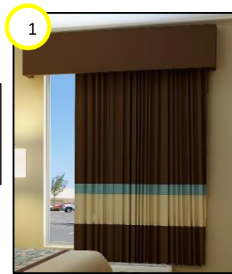
1) Example of Wall Mount Valance at Ceiling