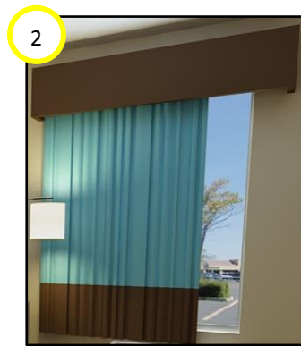
2) Example of Wall Mount Valance where window to ceiling is more than 18"

Step 1: The top of the large L Bracket should be placed 1" below the ceiling then mounted into the wall. **If the top of the window to the ceiling is greater than 18", take the length of the valance minus 2". This will give you the location where the L brackets should be mounted.***